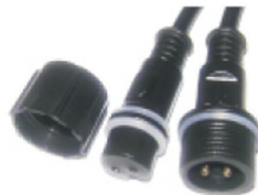
(12-24VDC power input port) 2 wires