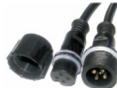
Output port (R, G, B, anode) 4 wires