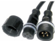
Input port (DMX signal) 3 wires