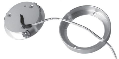
Base for surface mounted