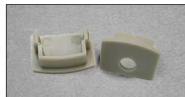
NTALB-02SP - Endcaps