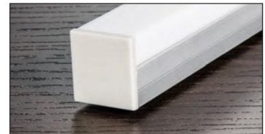
NTALB11 - OP