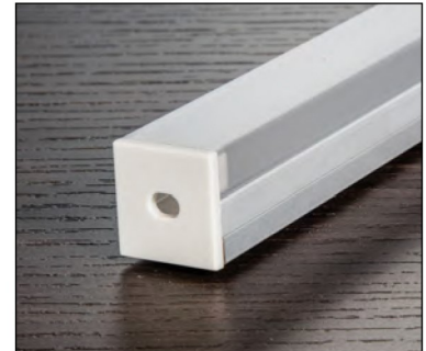
NTALB11 - FR