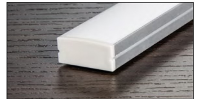
NTALB14 - OP