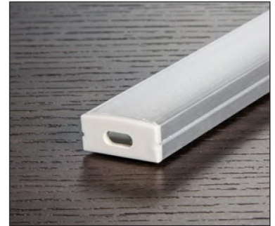
NTALB14 - FR