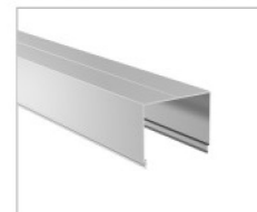
Aluminium wire cover