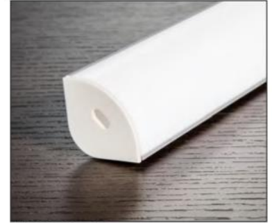
NTALB16 - OP