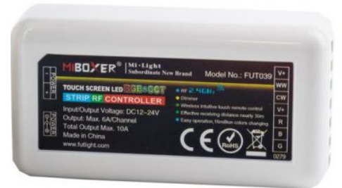
85mm x 45mm x 22.5mm

It has a full range dimming from 1 to 100%. Communication with the controller is a 2.4GHz - that provides fast response to commands from the remote control NTFUT-REMOTE-RGBW-ACO or with NTFUT-DMX-TRANS