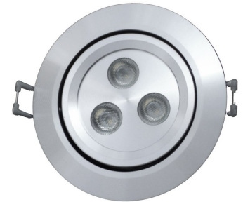
NTL-070-RD-9W-XX SATIN ALUMINUM FINISH