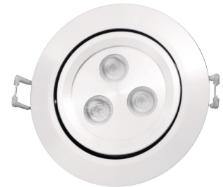
NTL-072-RD-9W-XX WHITE FINISH