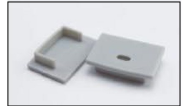
NTALB-44- end caps