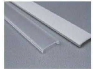
Frost or opal