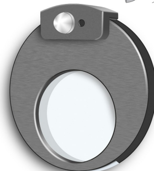
02 PIR motion sensor